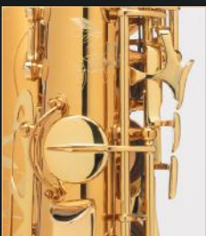
Redesigned shapes and placements of the side keys, facilitating fluid passage from one to the other

The global aesthetics of the Supreme has been reconsidered evoking the fluidity of play through sleek lines and roundness through the softening of angles.