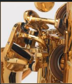
Hinged toggle on left hand pinky finger keys for greater ease of movement from one key to another