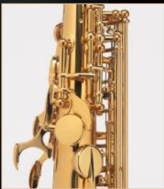
Octave key system with Teflon inside the sockets which lighten the action