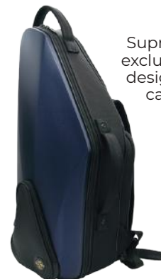
Supreme exclusively designed case