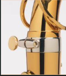
Adjustable clamping ring of the socket made of nickel silver