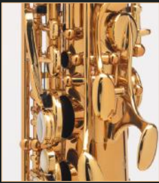
Lightening of the C# correction system