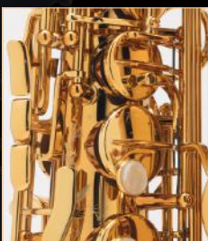
Direct arm between the right-hand F# and F keys allows for a finer and more reliable adjustment