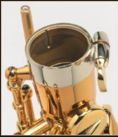
3-point concentric clamp for a better neck-to-body connection