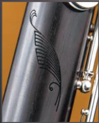
The feather, a symbol of lightness and creative freedom