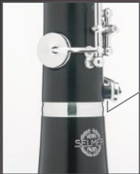
Correction tone hole for low E on the lower joint!