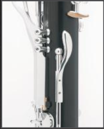
Adjustable thumb rest