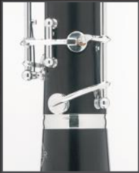
Correction system for low F and E notes with adjusting screw