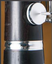
New ring design

The original laser engraving on the bottom body of the instrument is inspired by the values of generosity, listening and transmission of the musical practice.