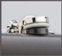
G# / C# precision optimized by a raised tone hole