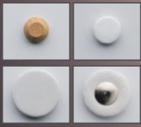
Efficient sealing: leather pads fitted with resonators for the low notes (except Eb), Core-Tex pads on the upper joint and cork pads for the 12 th key