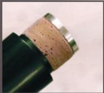
Upper joint fitted together with the crimped metal lower joint